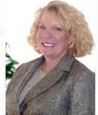
On Site, On Your Side™

Helping Watergate & Emeryville Sellers, Buyers, Landlords - call on your neighborhood Realtor.