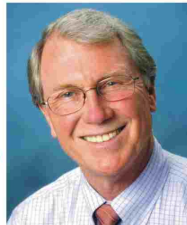
On Site, On Your Side™

Let my 27+ years of experience at Watergate make the difference for you. Don't delay, call today.