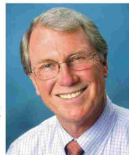
On Site, On Your Side™

Let my 27+ years of experience at Watergate make the difference for you. Don't delay, call today.