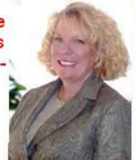
On Site, On Your Side™

Helping Watergate & Emeryville Sellers Buyers, Landlords - Call on your neighborhood Realtor...Robin.